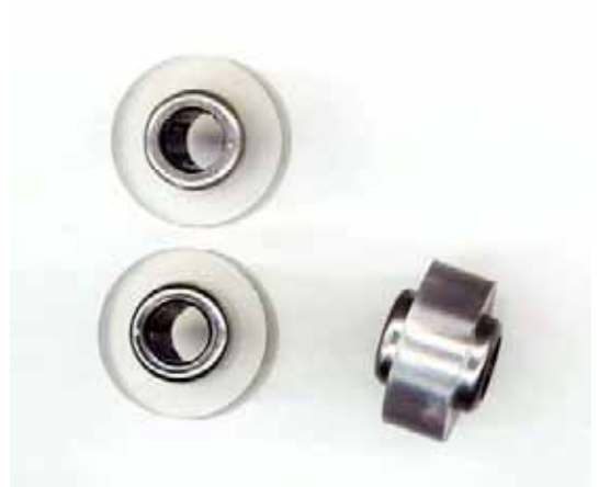
Molded rolls pressed on hubs