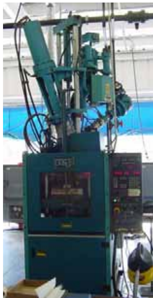
REP injection molding machine

Cure conditions evaluated were 5'/170°C, 3'/180°C, 2'/180°C, and 1'/185°C. All conditions gave parts with good look and feel. The runner was well-cured and showed good flow of the compound.