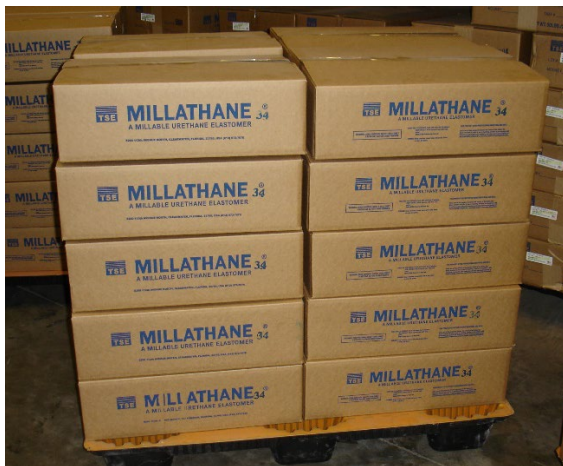
Premilled Millathane® E34