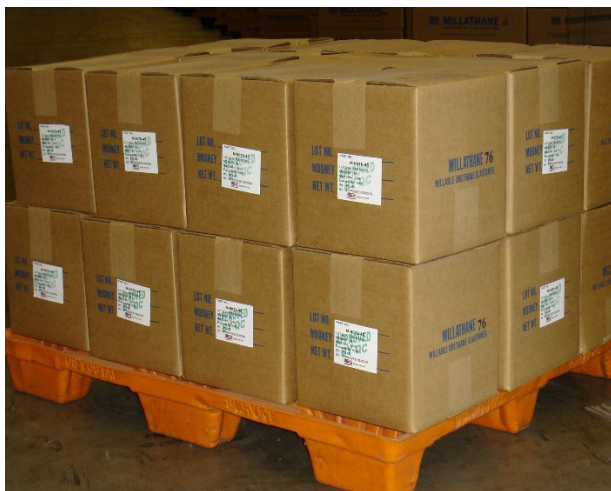
Standard Skid Virgin Millathane® 76