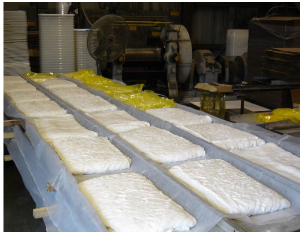
Premilled Millathane® 76 Milled Sheets