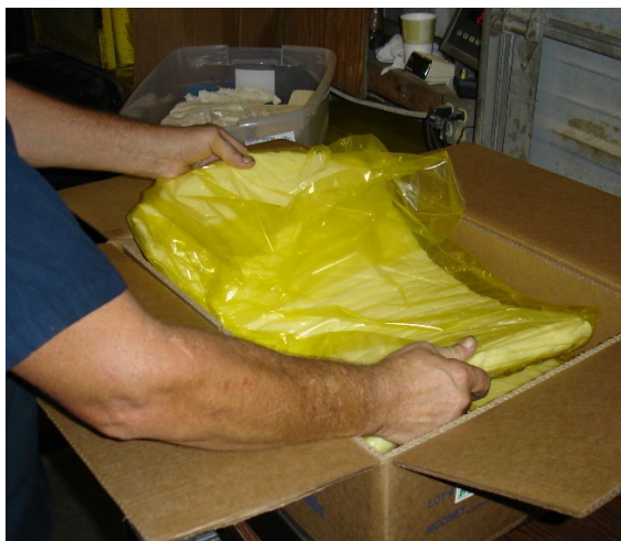
Packaging Millathane® 76 Premilled Sheets