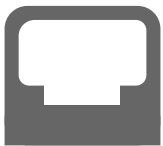
D Style Profile 12967