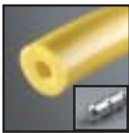
Hollow Belt w/Connector