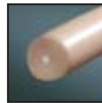
Smooth Reinforced Round