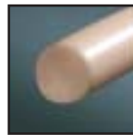
Smooth Surface Round