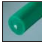
Smooth Reinforced Round