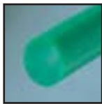
Rough Surface Round