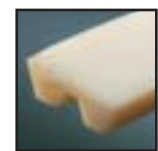
Parallel (Twin) V-Belt