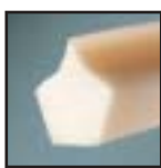
Ridge-Top V-Belt - Form 1