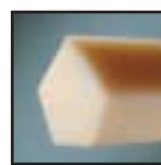
Ridge-Top V-Belt - Form 2